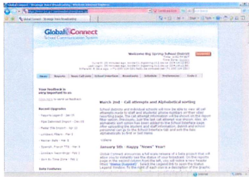
The Global Connect emergency call system can be set up to mass-deliver a message in just five minutes.

View and buy photos from The Sentinel Here.